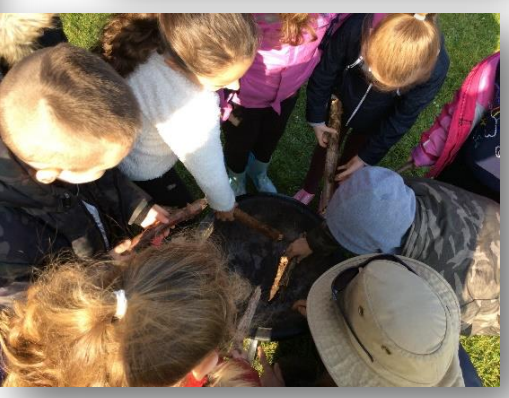
Year 3 enjoyed their visit from the Kent Wildlife Trust to teach the children survival skills they would have needed in the Stone Age. The children learnt how to make their own fire and create their own shelter. The children also helped to revamp the school's pond area!