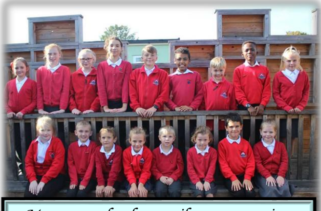
Meet our school council representatives 2018-19

We look forward to sharing all their wonderful thoughts and ideas at the School Council meeting, next term.