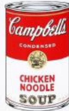
Campbell's Soup 1 – Chicken Noodle by Andy Warhol 1971