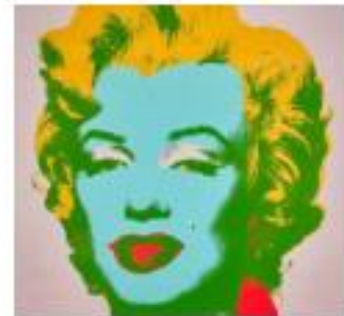
Marilyn Monroe by Andy Warhol 1967