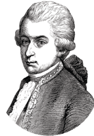
Wolfgang Amadeus Mozart 1756 - 1791

In this unit you will be composing music using the form Theme and variation.