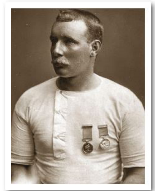
Captain Matthew Webb

Many of the hardships that Matthew Webb had to deal with during his pioneering swim are still faced by modern-day Channel swimmers. In fact, some of his methods for dealing with these hardships are still used today. Webb coated himself in oil for protection against the cold and jellyfish stings. He was also accompanied by boats so his friends could protect and feed him. It must be said, however, that the ale, brandy and beef tea they supplied are not standard for today's cross-Channel swimmers!